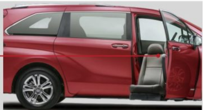
(2021 Sienna prototype shown with BraunAbility Turny Evo mobility seat)

Vehicles with mobility services' adaptive equipment are modified by a third party. Those modifications may affect fuel economy, driving performance, durability, and the safety of the vehicle. They may also affect the performance of Toyota Safety Sense and may affect the new vehicle limited warranty.