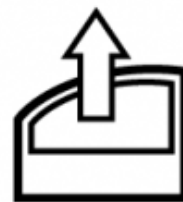
screens & seat adjusters