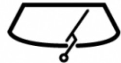
windshield wipers & signal stalks