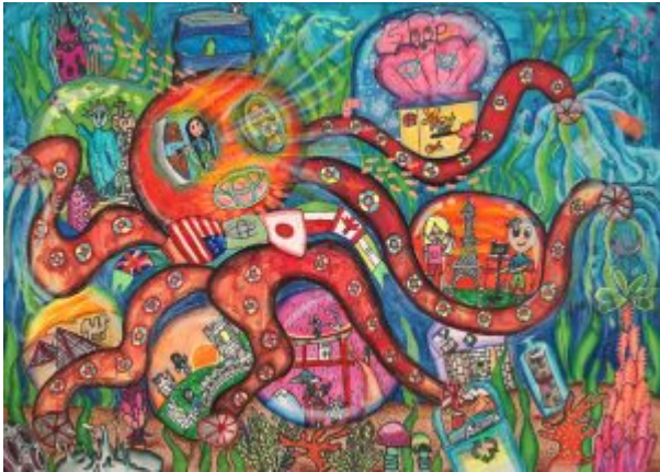
Gold Award: Bubble Water Car by Khloe Wang, age 7, South El Monte, CA